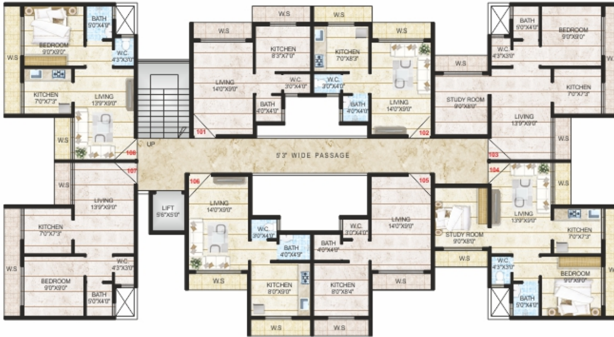
TYPICAL FLOOR PLAN (WING-A, B & C)