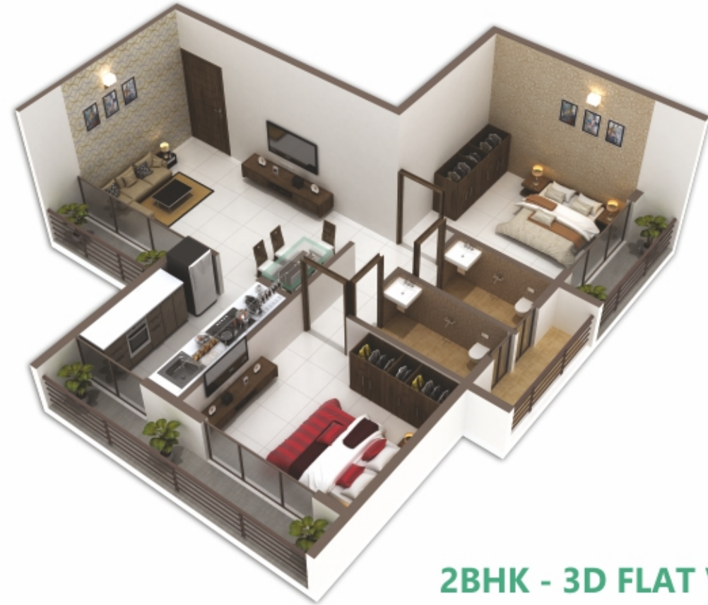
2BHK - 3D FLAT VIEW