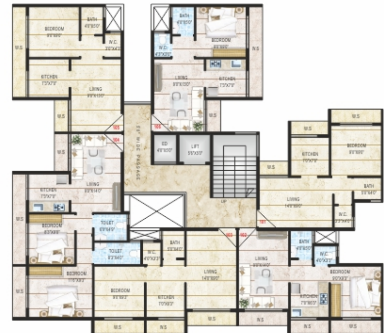
TYPICAL FLOOR PLAN (WING-D, E, F, H, I, L & M)