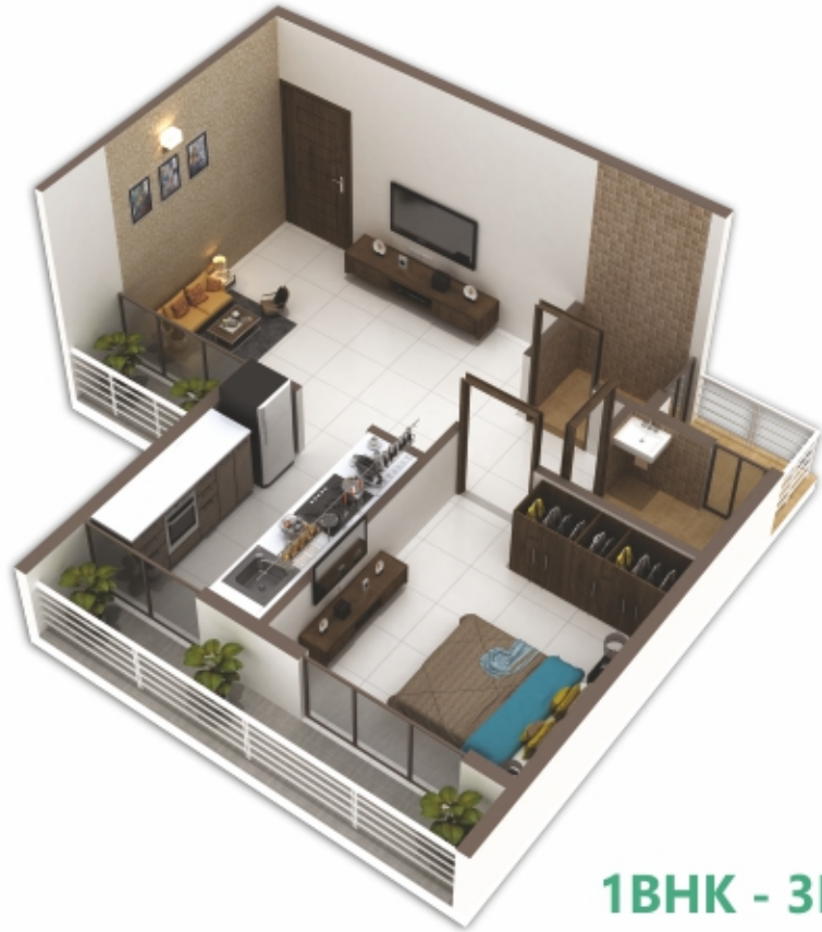
1BHK - 3D FLAT VIEW