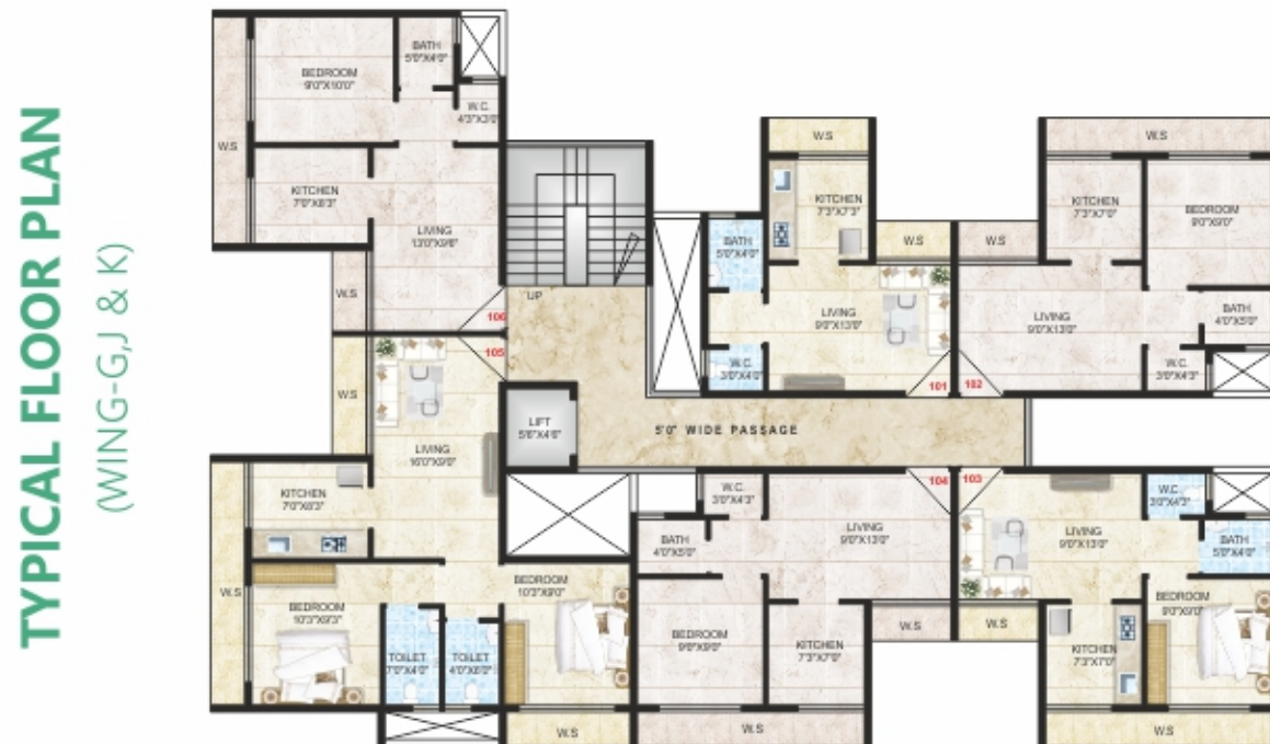
TYPICAL FLOOR PLAN (WING-G, J & K)